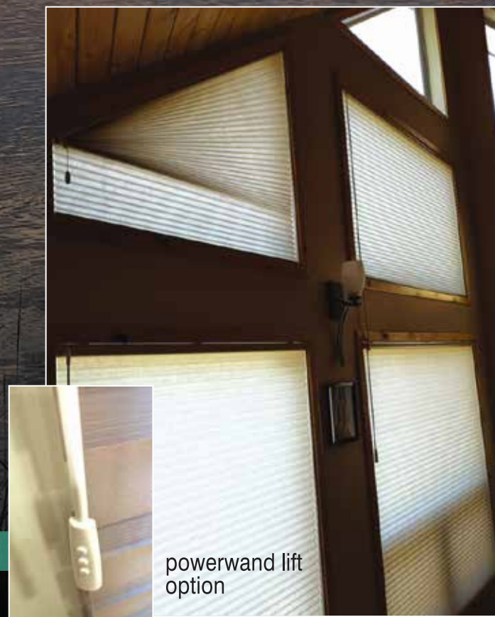
powerwand lift option